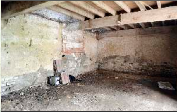
Inside existing building