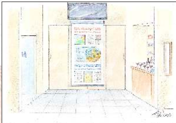
Artist impression inside extension